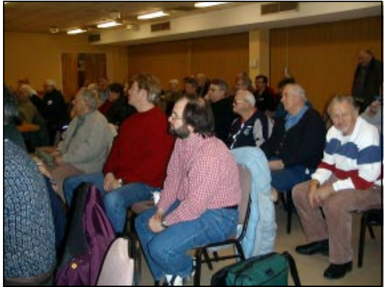
It was a big turnout at the Burlington Club meeting.

E ach of us is convinced that he is a good driver and each of us thinks that to take a good photograph is in his nature. Well, think about that again!