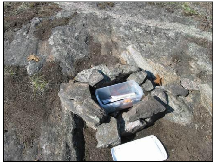
Here's the hidden cache.