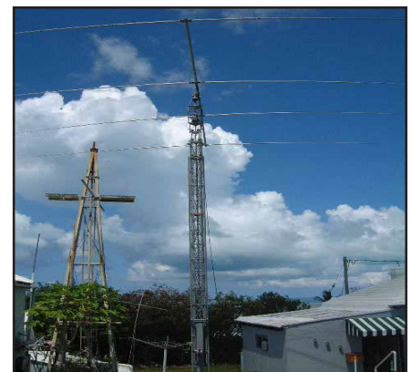
6 elements in paradise.