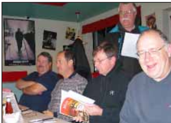
The Saturday Morning Breakfast Club

I like Saturday morning breakfast gatherings! Friendly atmosphere, strong coffee and a dose of unhealthy cholesterol - it is a catalyst for new ideas and discussion. There, I can listen to requests and ideas for organizing the program for our club meetings.