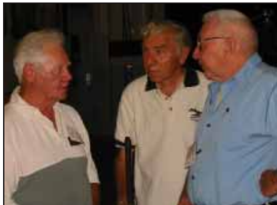
The tour included time to chat.